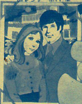
FREE SOUVENIR PROGRAM AND PHOTO

ENJOY UNLIMITED USE OF ALL DISNEYLAND ATTRACTIONS ALL NITE LONG! ... including Disneyland's newest attraction COUNTRY BEAR JAMBOREE